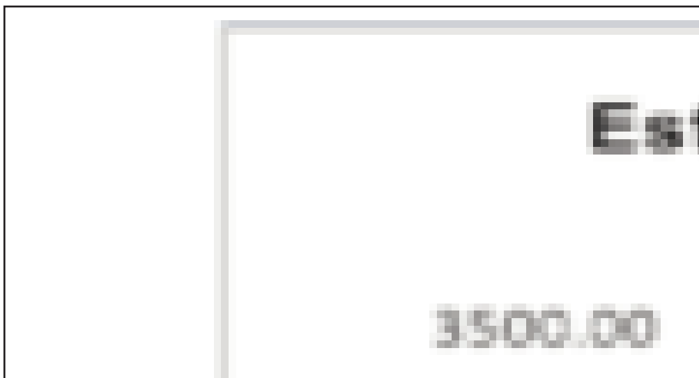
Figure 20.3: Therapists grouped into thirds based on their adjusted scores as a function of their accumulative time spent on solitary practice in the first eight years of clinical practice.

tifying where one's performance falls short, seeking guidance from recognized experts, and then developing, rehearsing, executing, and evaluating a plan for improvement. Research indicates that elite performers across many different domains devote the same amount of time to this process, on average, every day, including weekends. In a study of violinists, for example, Ericsson and colleagues found that the top performers devoted two times as many hours (10,000) to deliberate practice as the next best players and ten times as many as the average musician. In addition to helping refine and extend specific skills, engaging in prolonged periods of reflection, planning, and practice engender the development of mechanisms enabling top performers to use their knowledge in more efficient, nuanced, and novel ways than their more average counterparts (Ericsson & Stasewski, 1989).